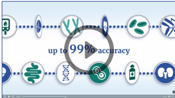
Learn about the Essential Genomic screenings (Click to watch)